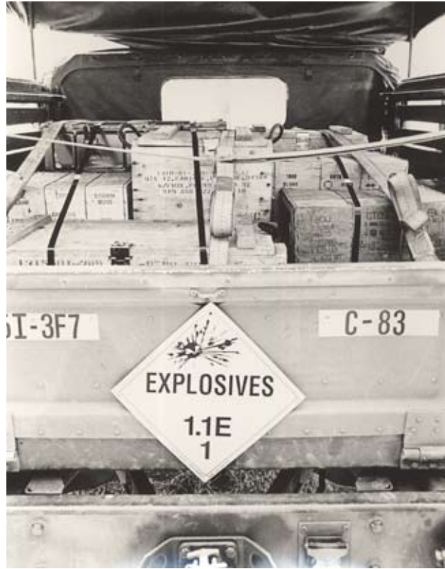
Truck filled with explosives at Makua Military Reservation, 1996.

created a sanctuary, drawing upon the traditional concept of pu'uhonua . As one resident described, Makua served as a safe place for "healing our past of torment and destruction." 34