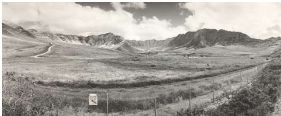
View of Makua Military Reservation from Farrington Hwy.

Nevertheless, military bases in Hawai'i continue to expand because Hawai'i is home to the Pacific Command, the command center for U.S. military operations for half of the globe. p Its outposts include bases in the Marshall Islands, Guam, Okinawa, Japan, and Korea. According to the U.S. military, bases are built for the purpose of "defense" in the event of violent struggle with other nations. However, military dominance also protects and enables commercial interests. The most direct example is the armaments industry, a business worth $200 billion worldwide. q