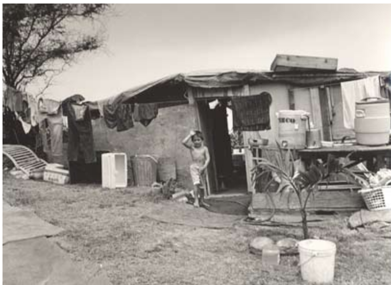
Young boy living at Makua, 1996.

The stated purpose of the 1996 Makua eviction was to clear the area for public use. af However, it was no coincidence that the land clearance occurred at a time when the need for military training sites became a priority. ag To this day, the U.S. Army continues to utilize Mākuā Military Reservation and their activity has resulted in significant damage to the valley. Damage includes but is not limited to numerous disastrous fires. The most recent example was in the summer of 2003. The fire, deliberately set by the Army, was meant to clear 900 acres of land. Due to a shift of wind, the fire raged out of control burning 2,100 acres and destroying many of the remaining sacred sites in the valley. ah In Makua Valley, the homes and communities have been burned repeatedly, both literally and figuratively.